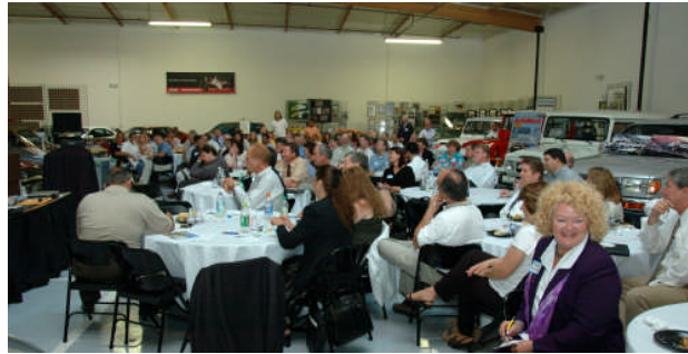
June 2006 Regional Event At Toyota Car Museum