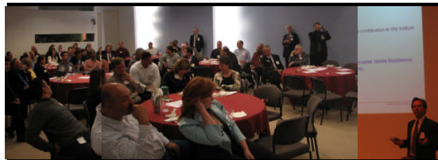
December 2005 Gala At The Getty Museum

ITIL is a Registered Trade Mark, and a registered community Trade Mark of the Office of Government Commerce, and is Registered in the US Patent and Trademark Office.